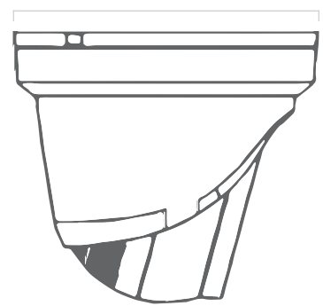
138.3 mm (5.45 in)